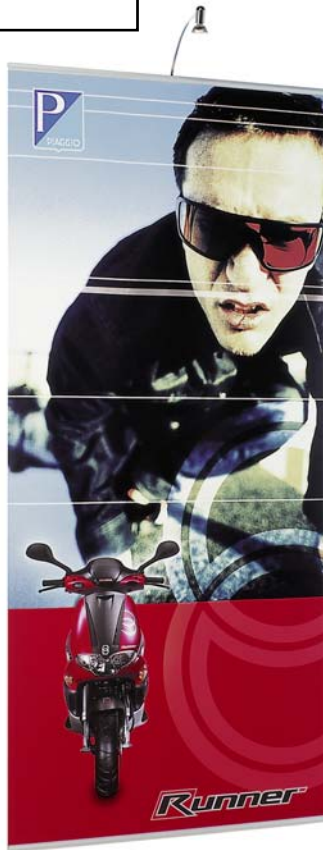
39 3 / 8 " Wide x 86 5 / 8 " High shown with optional spotlight