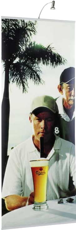
27 9 / 16 " Wide x 70 7 / 8 " High shown with optional spotlight

Metal snap-in clip for EBS profiles allows a graphic to be hung in a window, on a wall or from the ceiling. Sold in quantities of 10 or 100