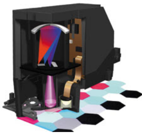
Built in Spectrophotometer